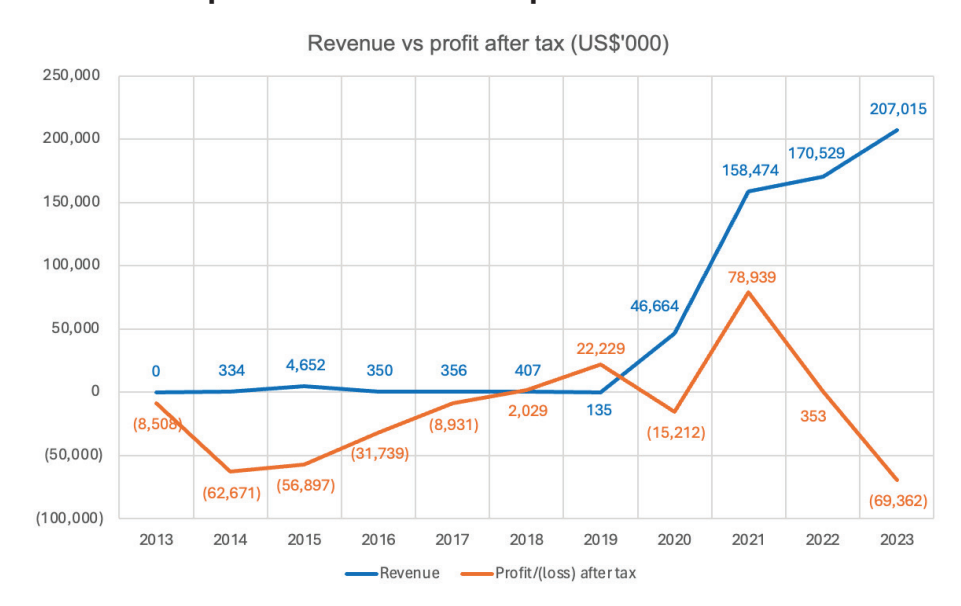
RIHL's revenue vs profit after tax since inception<sup>9,10,11,12,13,14,15,16,17,18</sup>

RIHL reported negative profit after tax (PAT) from 2013 to 2017.5 While the company has shown stronger revenue growth since 2019, its PAT remained inconsistent. For instance, in the financial year (FY) 2020, RIHL experienced substantial revenue growth of 345% from FY2019, yet still incurred a negative PAT of US$15.21 million.<sup>6</sup> In FY2022, despite revenue reaching US$170.53 million, PAT plummeted by 99.5%, from US$78.94 million in FY2021 to US$353,000 in FY2022.7 Further in FY2023, despite achieving its highest revenue figure since establishment, U$$207.02 million, RIHL again suffered a negative PAT of U$$69.36 million.8