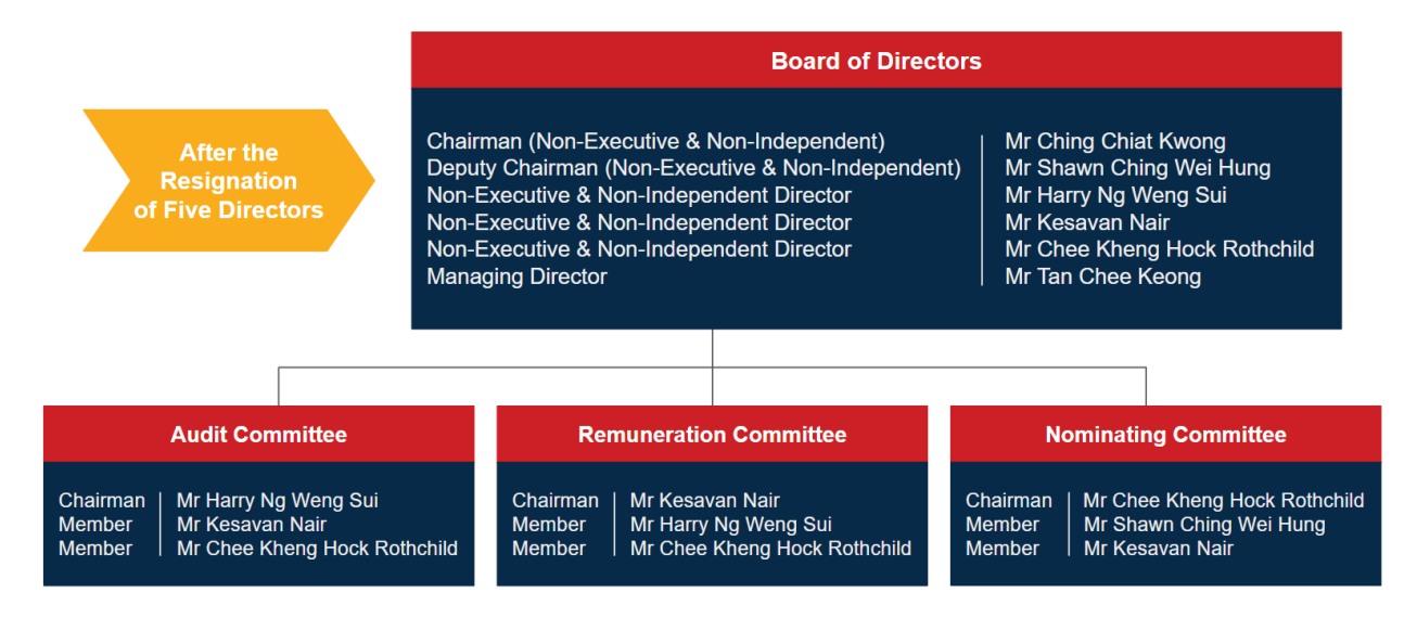
Figure 2: Board composition after the boardroom tussle<sup>133</sup>