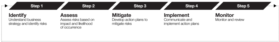
Figure 1: KOM's five-step process 25

KOM's five-step process from risk identification, assessment, mitigation, implementation and communication to risk monitoring and review in their day-to-day operations and discussions.